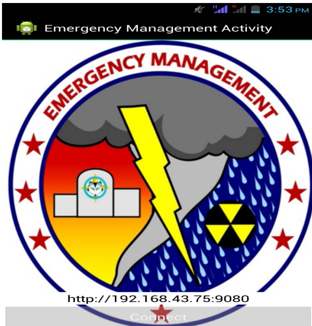
Fig 1. Admin Android App User Interface

EMS drives to and responds to emergencies. It serves as the head for emergency preparedness. It also plans, organizes and mobilizes the emergency rescue efforts of the agencies (i.e. Public Health, Mental Health, Public Works, Police department, Fire department, Volunteer agencies etc.) during emergencies. In the end , it compiles data and prepares a variety of records and reports. Along with this it prepares public information materials i.e. analyses the services and materials required for emergency preparedness, response and recovery operations, and suggests for the development of the same. The EMS overview is been illustrated in Figure 2. The EMS system consists of a Web server and smart phone based application, these currently implement as an android app. The app operate in two modes. Network mode and GPS mode.